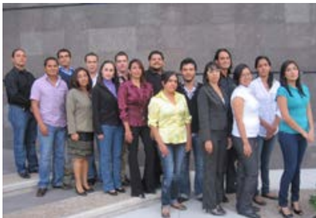
Facilitators of the Environmental Education for Sustainability Workshops

This phase lasts around eight hours, corresponding to four working sessions.