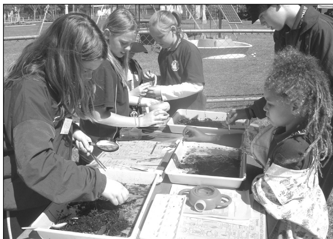
Learning about the diversity of life.

The first step in the process was putting teachers into planning teams to map out how the Earth Charter could be used as an underpinning philosophy for current and future units of work. Teachers examined available Earth Charter resources (DVD, posters, web resources) and were each given an Earth Charter poster to put up in their classrooms. The result of this day was the development of our 2007 Sustainability Action Plan,