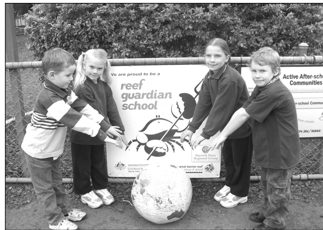
Learning about our place in the world.

The implications for a school community, if all members upheld these four simple principles, are both exciting and challenging. We think that the understanding of, and adherence to, these principles could significantly increase the potential for engaging students in real-life learning and improving student outcomes.