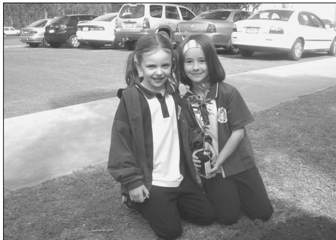
Tree planting day.

Our approach embraces our young people's initial abstract thinking about global issues by linking them directly to everyday local environmental problems. Action Science has indeed always been underpinned by the principles of the Earth Charter, even though we didn't formally recognize this. Our implementation of the Earth Charter into our school curriculum has added another positive dimension to Action Science; students are able to see the importance of their local work more clearly in terms of its global impact. It reinforces the idea that we all have a role in creating a sustainable future and that each positive action contributes to the wellbeing of our planet and its inhabitants.