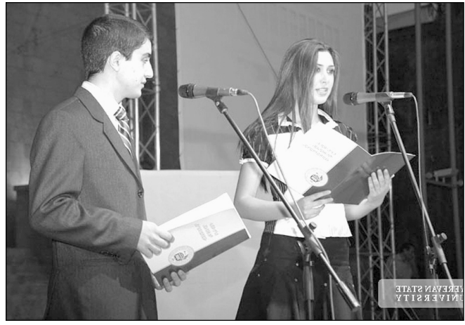
The oath of the University freshmen.

She starts her course by handing out the Earth Charter brochure (in Armenian, Russian and English languages) to the students, so that they can read this at home. In her classroom, discussion is encouraged. To facilitate practical exercise, she breaks students into four working groups in accordance with the four main pillars of the