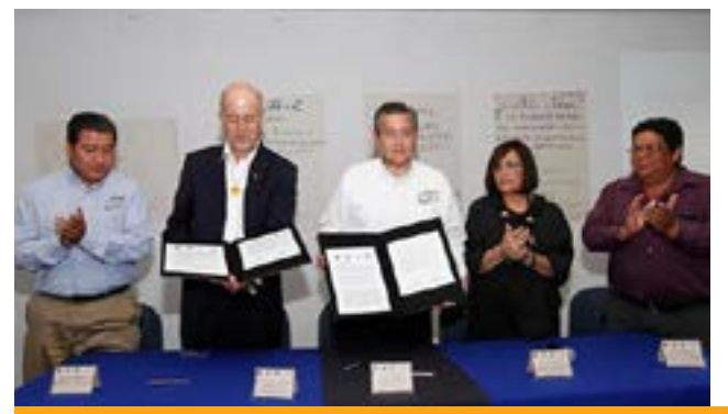
Signing the Earth Charter endorsement