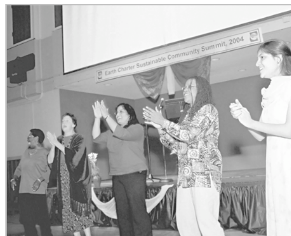
African group song at the New palts (New York)