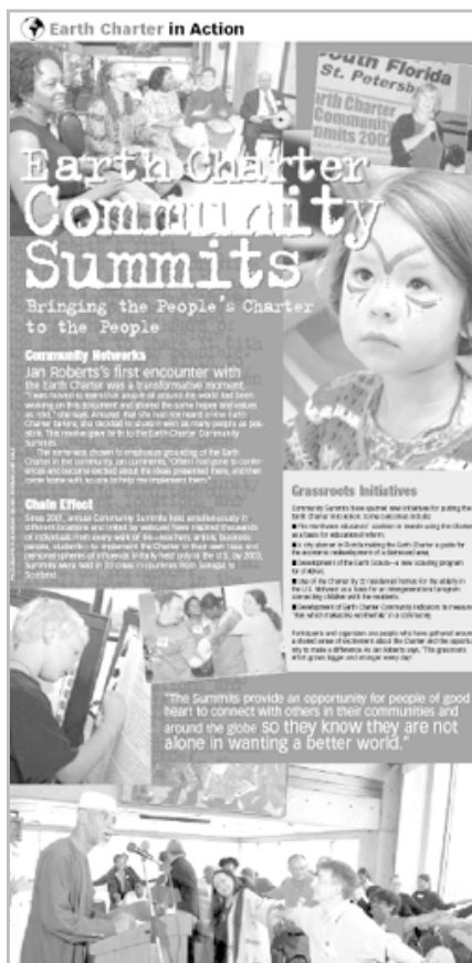
SGI panel on the community summits