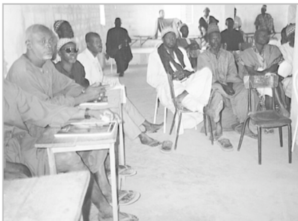
Senegal Earth Charter local summit

Most individual Summits have been supported through large in-kind donations. In-kind items have included space, printing, food, advertisements, equipment, and volunteer time. Individual Summits have also received financial support from NGOs and donors. For example, for the launch of the project in 2001, $160,000 was raised to cover costs for the Tampa Summit and satellite broadcasting costs, so all cities could see one another. In 2004, the project's estimated in-kind budget raised was $317,000 (not to mention the volunteers' time and effort).