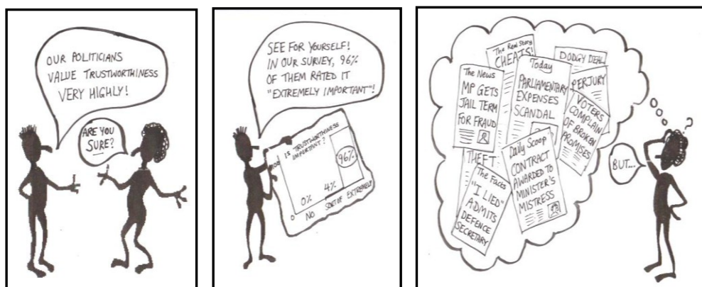
Figure 1. The fallibility of self-report surveys for values.

As noted by Schlater and Sontag [42] (p. 5), there is often a mismatch at the individual level between the public espousal of values in discourse and their enactment in behavior: “A person may ‘talk’ the value but not implement it in action, or a person may act in accordance with a value but not subscribe to it verbally.” Values surveys cannot measure enactment of values by individuals, organizations or states, but only what they are willing to articulate verbally: they do not offer any way of identifying whether there is a mismatch between the values implied by respondents’ survey responses and those manifested in their real-life actions (Figure 1). We are not suggesting that what people say about their values is unimportant, but rather that attempts to develop useful values-based sustainability indicators should examine the question of enactment (e.g., by observing behavior or conducting surveys of peers) instead of relying entirely on self-report surveys.