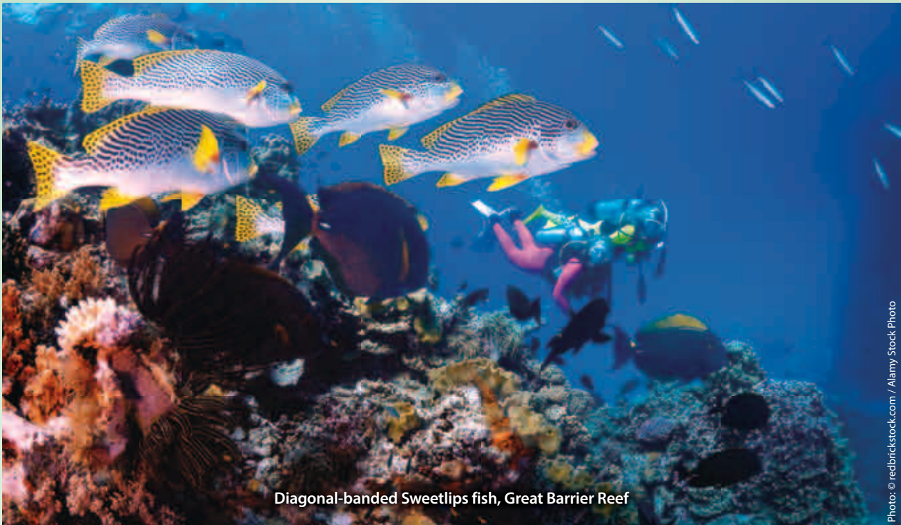
Diagonal-banded Sweetlips fish, Great Barrier Reef