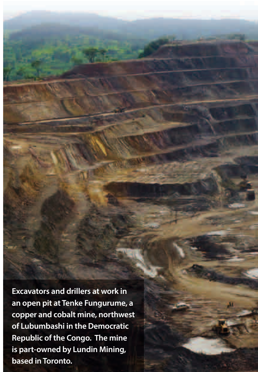
Excavators and drillers at work in an open pit at Tenke Fungurume, a copper and cobalt mine, northwest of Lubumbashi in the Democratic Republic of the Congo. The mine is part-owned by Lundin Mining, based in Toronto.

The warming (of the climate) caused by huge consumption on the part of some rich countries has repercussions on the poorest areas of the world, especially Africa, where a rise in temperature, together with drought, has proved devastating for farming. There is also the damage caused by the export of solid waste and toxic liquids to developing countries, and by the pollution produced by companies which operate in less developed countries in ways they could never do at home, in the countries in which they raise their capital.