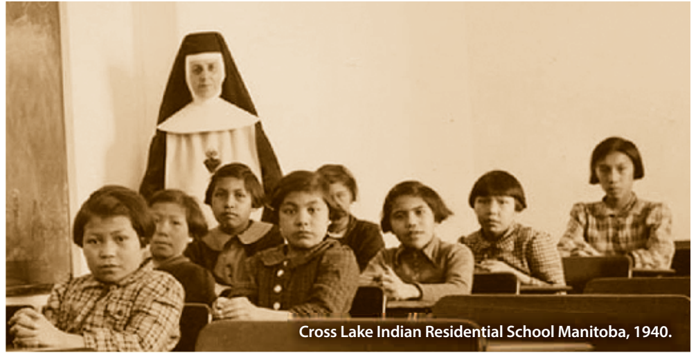
Cross Lake Indian Residential School Manitoba, 1940.

New processes taking shape cannot always fit into frameworks imported from outside; they need to be based in the local culture itself. As life and the world are dynamic realities, so our care for the world must also be flexible and dynamic. Merely technical solutions run the risk of addressing symptoms and not the more serious underlying problems.