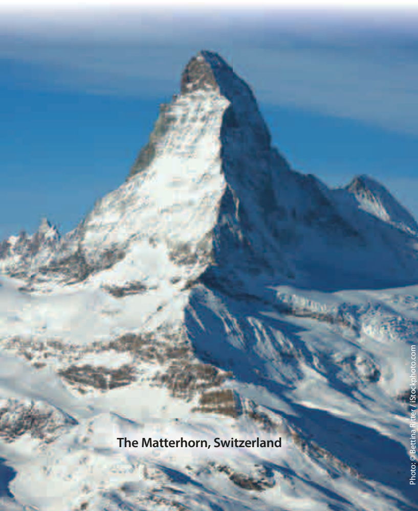
The Matterhorn, Switzerland

At the same time, we have “a sort of ‘superdevelopment’ of a wasteful and consumerist kind, which forms an unacceptable contrast with the ongoing situations of dehumanizing deprivation” (Benedict XVI), while we are all too slow in developing economic institutions and social initiatives which can give the poor regular access to basic resources. (109)