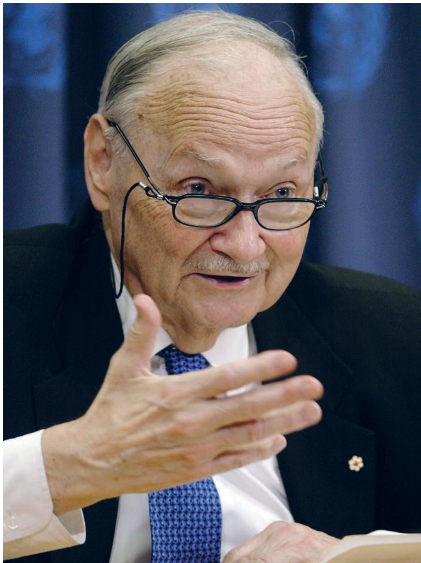
Talking about the Green Agenda

Many claim to have changed the world for the greater good – Maurice Strong really did.