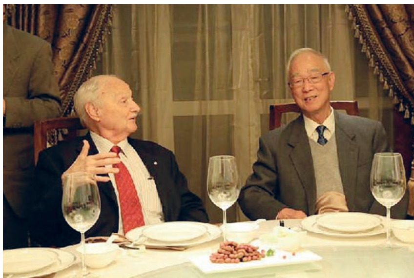
Maurice met with Qu Geping in 2012.

international cooperation in the field of environmental protection, Chinese government established China Council for International Cooperation on Environment and Development (CCICED) in 1992. Premier Wen Jiabao was then present at the 2008 CCICED annual meeting. Speaking of China's attending the first UN Conference on Human Environment in 1972, Maurice Strong recalled: "I have a very deep relationship with China. I have established contact with China before the Stockholm Conference. After the Conference, Qu Geping became my friend. Qu is an environmental expert respected by the world. My environmental career has a lot to do with China, which is why I am willing to live and spend the final stage of my career in China. All the actions of China have an important impact on the world."