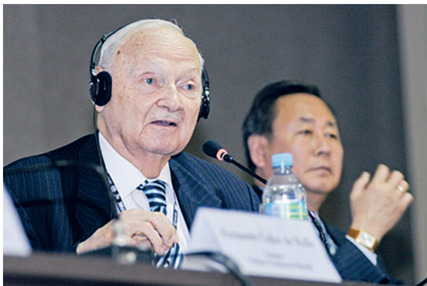
MFS speaking at "Rio+20", UN Conference on Sustainable Development, 15 June 2012

forum in place of the United Nations. Such inhumane groups should not prevent humanity from undertaking its essential mission: to ensure a decent standard of living to each and every person without exception.