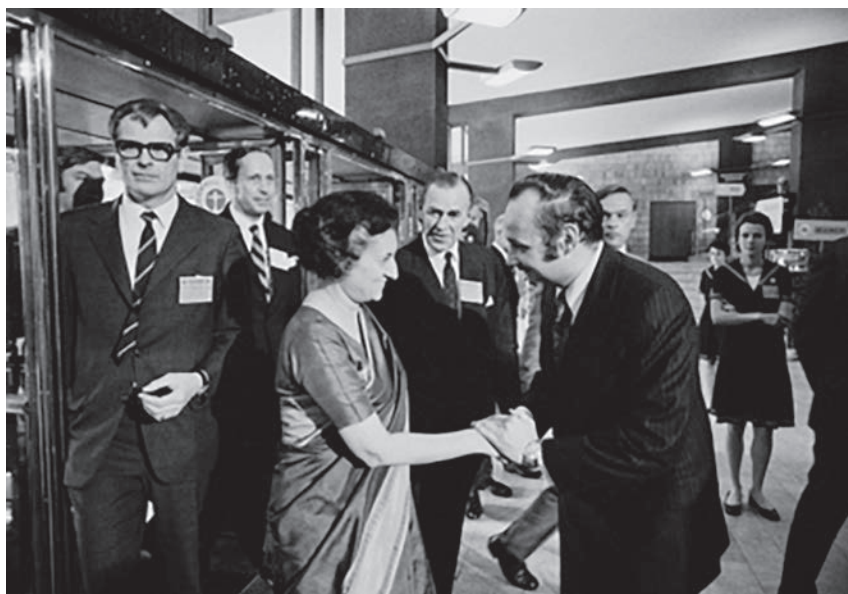
MFS greets Indira Gandhi at her arrival to attend the Stockholm Conference, 5 June 1972.

human health and natural ecosystems - was to take place at Stockholm in June 1972. In the months leading up to the Conference, Maurice, recently appointed Secretary-General for the Conference, undertook a grueling series of world tours to mobilize the intellectual, political and civic support for global action needed to protect the environment generally, and for the Stockholm Conference in particular.