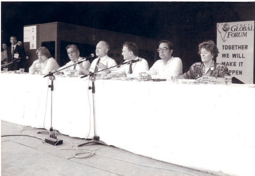
MFS addressing NGO Forum at The Rio Earth Summit 1992

Indeed, in today's world, the issue of inequality has reemerged as a great global concern, one that Maurice Strong was acutely aware of towards the end of his long and impressive life of service to humanity and the common good.