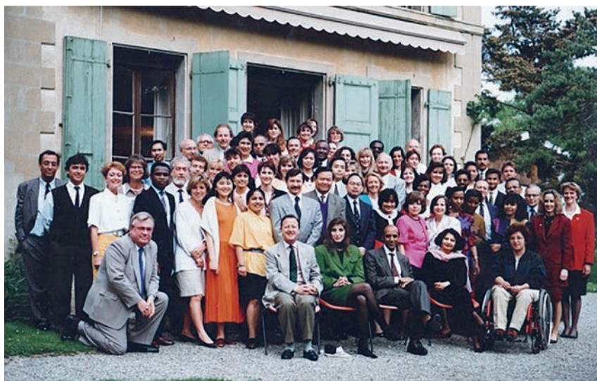
The Staff of UNCED Secretariat in Conches, Geneva, 1992

Values do matter because without a shared global ethic, key challenges before the world today will not be addressed. Slowly in fits and starts, and occasional setbacks, such an ethic is emerging. The great global conferences of the 90s, led by Rio, have been part of this process. A global community is emerging in the growing number of activists, academics, corporate leaders, media persons and even some politicians who are looking beyond national interest towards a global interest. Maurice Strong was a pioneer in this emerging global community as a committed internationalist who saw the world as his homeland. What mattered to him was the wellbeing of each and every country and every person on this our blue planet. That is why he was truly a global citizen.