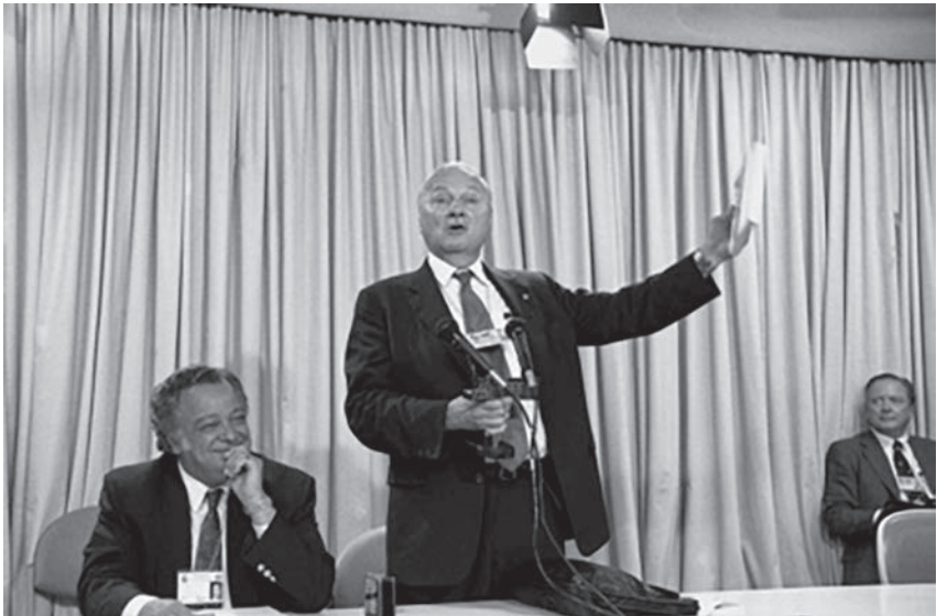
MFS promotes the book "Our Country, the Planet", authored by Shridath Ramphal for UNCED, 5 June 1992

This book is impressive in its sweep, its depth, and the universal embrace of its compassion. It was written, moreover, with real eloquence. The reader who is not stirred to seek action must be one of those whom not even Mark Antony could have moved.