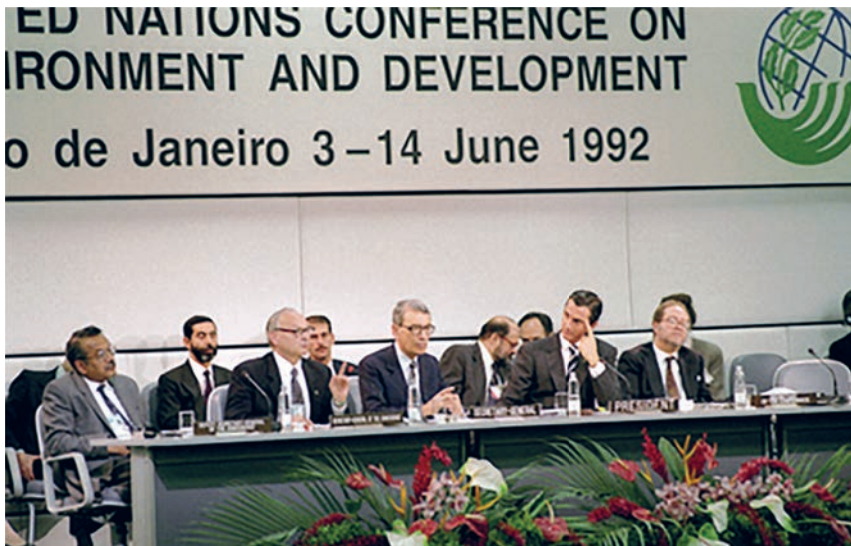
MFS making a statement at the opening of UNCED, 3 June 1992

In a very real sense Maurice Strong was a man of many parts. He pursued his global ends in his work with international organisations, his engagement with global networks of NGOs, his connections in and with the corporate world and in his activities in his native country: Canada.