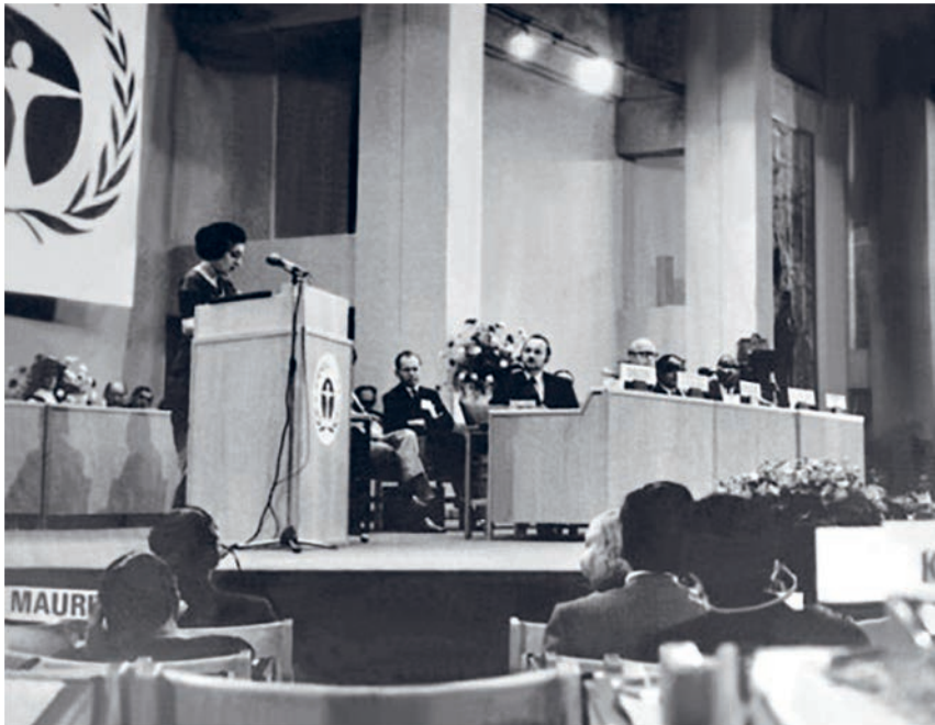
Indira Gandhi addressing Stockholm Conference, 14 June 1972, with Maurice Strong in the front row

In his last public message, Maurice Strong called for a forceful climate agreement in Paris in 2015 in the realization that the future of life on earth depends on what we do, or not do, in this generation. He would not witness the successful conclusion of these negotiations, but his spirit is very much present as the follow-up is now being challenged by the announced withdrawal of the USA from the accord. The transformation of international and national practices, and the many other contributions of his legacy should remain powerful tools to keep such processes on a steadfast and determined future course.