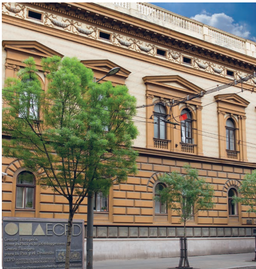
The historic core and the present CBD, where the ECPD Headquarters is located