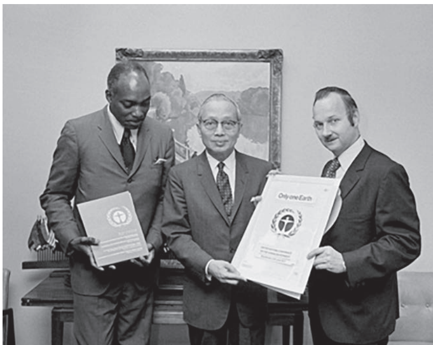
MFS shows to UN Secretary-General U Thant design for official poster for UN-CHE, 15 September 1971.

Time was not right in Rio for the Earth Charter, a proposed set of ethical principles to guide the transition towards a more just, sustainable, and peaceful world. After a wide-ranging