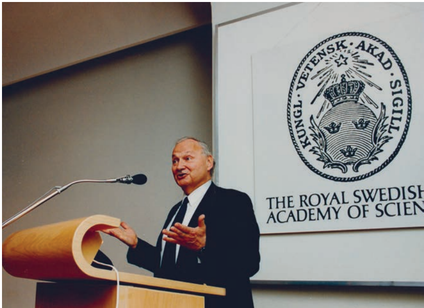
Speaking at Swedish Academy