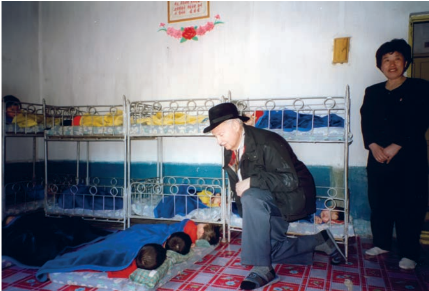
At the North Korean orphanage