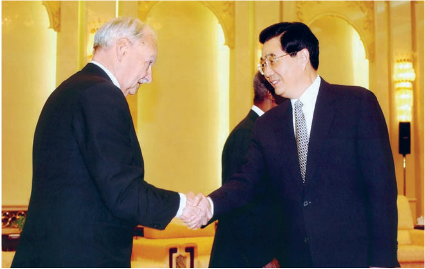
Maurice Strong with the former Chinese President Hu Jintao