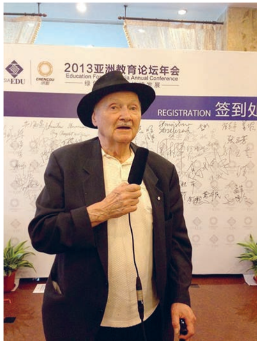
Maurice Strong at Education Forum for Asia Council Conference, Chengdu, 2013

Maurice Strong left his footprints in many regions, provinces and cities in China during his lifetime and worked tirelessly to personally participate in ecological and environmental protection forums and activities. Each event provided exciting and inspiring speeches. They reveal this old man's investment in China's environmental protection cause and his love for China, as well as his insights into the world economy, environmental protection and other fields.