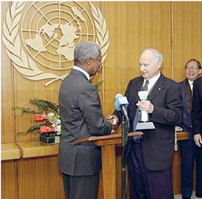
UN Secretary-General Kofi Annan presents Candlelight Award to MFS, 6 December 2002

He led through a combination of coalition building and inspira-tional exhortations. His mantra was "the process is the policy": all policies should be designed to promote the gradual inclu-sion of a variety of actor groups into a broad coalition behind