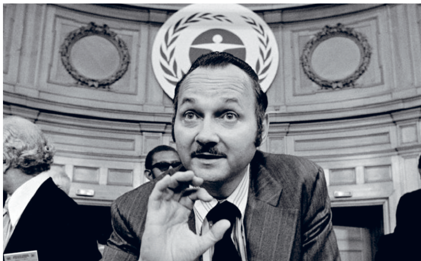
Strong speaking at Stockholm Academy