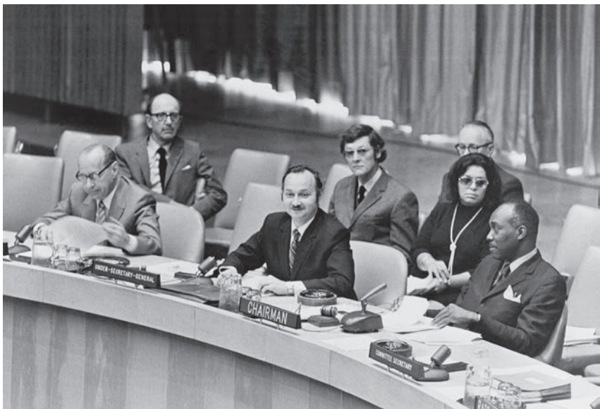
9 November 1970, Strong speaking at an informal meeting of the Preparatory Committee when he restored confidence in the Stockholm Conference process

As for Maurice Strong, through his global leadership role and lasting contribution via the United Nations, he played a pioneering role in the evolution and charting of the desirable course. Despite the current adversities sweeping the world, brought about by those same structural causes and actors at the root of the planetary "ecological crisis", signaled at the Stockholm Conference some 50 years ago, one hopes that the essence of the vision that emerged then and through continuing work and efforts evolved since will continue to be an inspiration and a driving force in the strivings of the progressive humankind for a just and equitable world order through enlightened, multilateral cooperation in the United Nations.