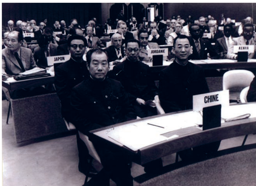
Qu Geping, at the Chinese delegation at the Stockholm Summit in 1972.

After China first participated in the 1972 UN Conference on Human Environment in Stockholm, Premier Zhou Enlai decided to set up an environmental protection agency. To strengthen