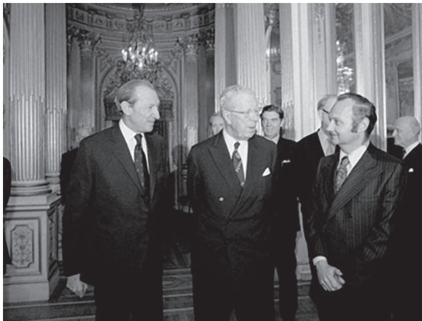
MFS with King Gustav VI Adolf and UN Secretary-General Kurt Waldheim, at UNCHE welcoming ceremony, 5 June 1972

informal meeting of the Preparatory Committee with extraordinary skill and delicacy.