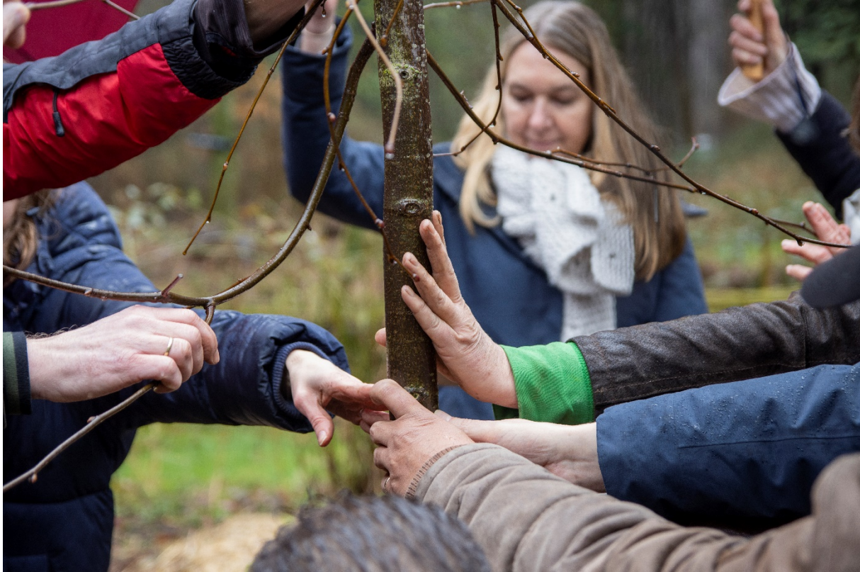
At the Zonheuvel Estate in February 2020: Planting the Linde-tree in the cooperative vegetable garden