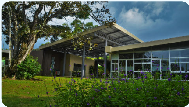
Earth Charter Center for Education for Sustainable Development

This course was developed under the framework of the UNESCO Chair on Education for Sustainable Development with the Earth Charter, coordinated by the Earth Charter Center for Education. The Chair is a collaborative effort between UNESCO, Earth Charter International, and the University for Peace to develop educational programmes and research activities related to education, sustainability, and ethics using the Earth Charter as a fundamental reference.