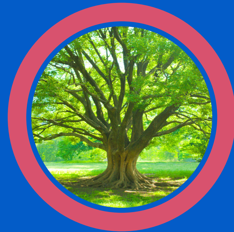
Champion Level "The Tree"