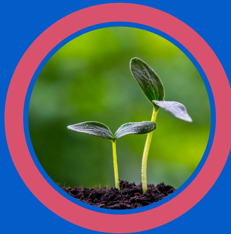
Intermediate Level "The Sprout"