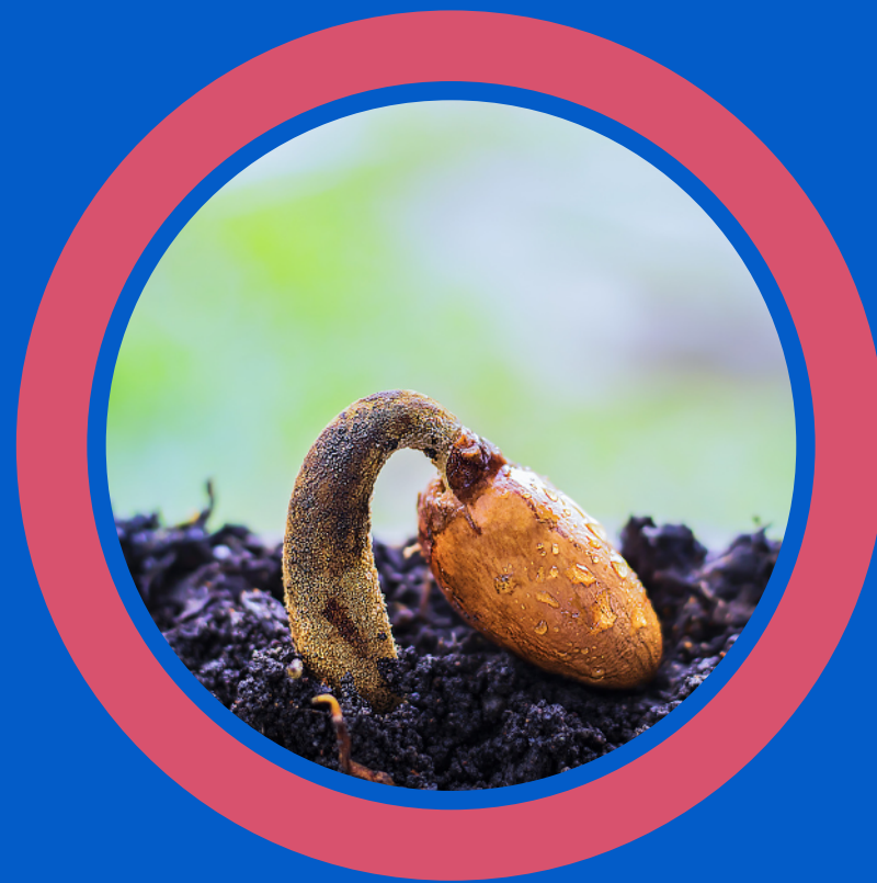
Beginner Level "The Seed"